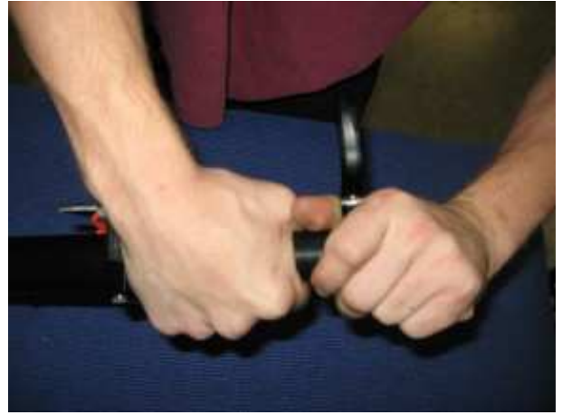
twist off clamp (or tap it off with a hammer)