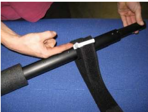
Slide off chest strap shown above. Then slide the head pad off.