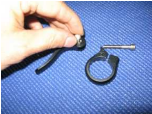
place round nut into lever