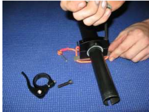
remove second screw