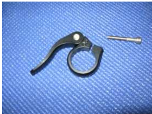
place lever in position