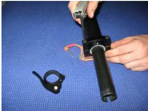
Remove screw on back of hook