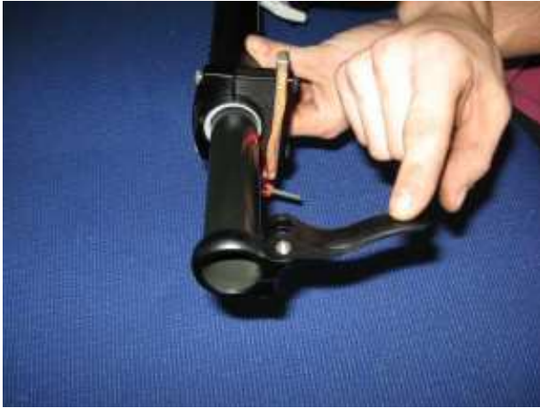
Open the clamp lever