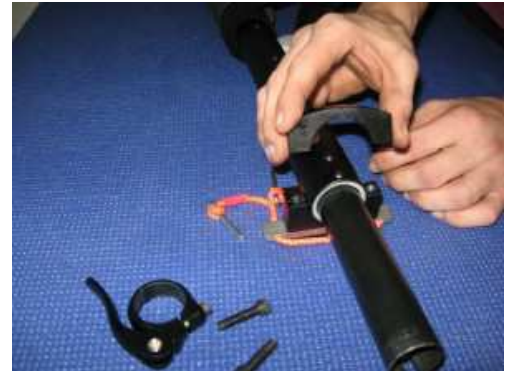
2 part hook should come right off